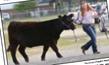
A cow is shown at the livestock show and sale at the Mount Olive Agricultural Center on Saturday, April 11.

The Mount Olive Agricultural Center will host a livestock show and sale on Saturday, April 11.