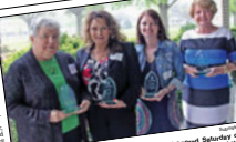
Several University of Mount Olive alumni were honored Saturday during their annual meeting.