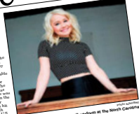
The 'Voice' star Raelynn will perform at the Mount Olive Airport on Friday, April 22.

Concert will be held Friday night, April 22, at the Mount Olive Airport. The Mount Olive Airport is located on Highway 101, just west of town.